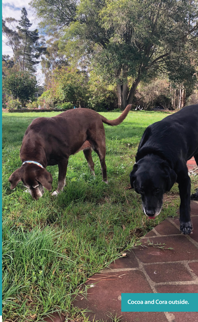
Cocoa and Cora outside.

This story of compassion, companionship, love, and loyalty touched many of us at Woods quite deeply as it illustrates the very essence of why we do this work. By helping animals we help people. It is our greatest wish that all animals would be loved as deeply as Cocoa and Cora, and as we work toward that goal, we extend our sincerest gratitude to you, our supporters, for making it possible.