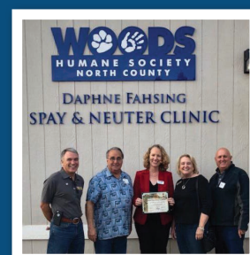
Awarded a certificate of Recognition from the County of SLO on the grand opening of our spay/neuter clinic.