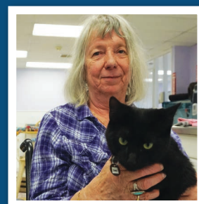
Stewart was lucky adoption number 814 for Atascadero – officially DOUBLING their adoptions since we merged!