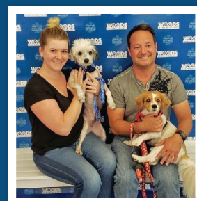
Helex, the 3000th animal adopted in 2018