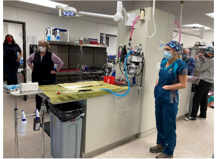
Figure 3: Short-staffed and in need of a full-time staff veterinarian, Woods Humane Society still managed to perform more than 5,400 sterilization surgeries in 2022, but is now unable to keep up with public demand.

“A slow-down of any kind in spay/neuter efforts can have a significant ripple effect on our local pet population. With shelters full across California, and with spring kitten season on the way, the veterinary shortage and the resulting restrictions on spay and neuter surgeries will only negatively impact an already dire situation. It is our top priority to recruit and hire veterinarians so that we can carry out the Woods mission and keep the SLO County shelter from experiencing the same overcrowding and unnecessary euthanasia that many other county shelters in this state are experiencing.”