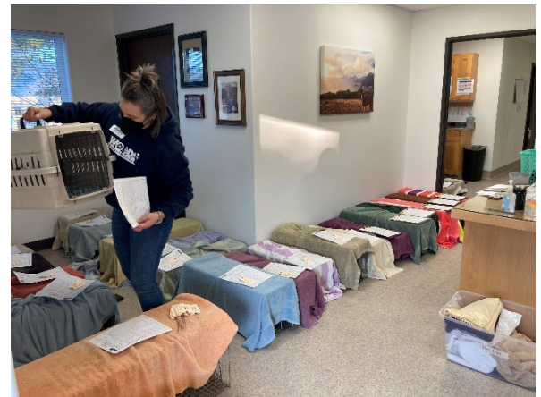
Figure 1: Woods Humane Society's Low-Cost Spay/Neuter Clinics perform an average of 5,000 spay and neuter surgeries for local pets each year. As part of a national shortage of veterinarians, the nonprofit organization has been unable to hire a staff veterinarian to keep up with demand.